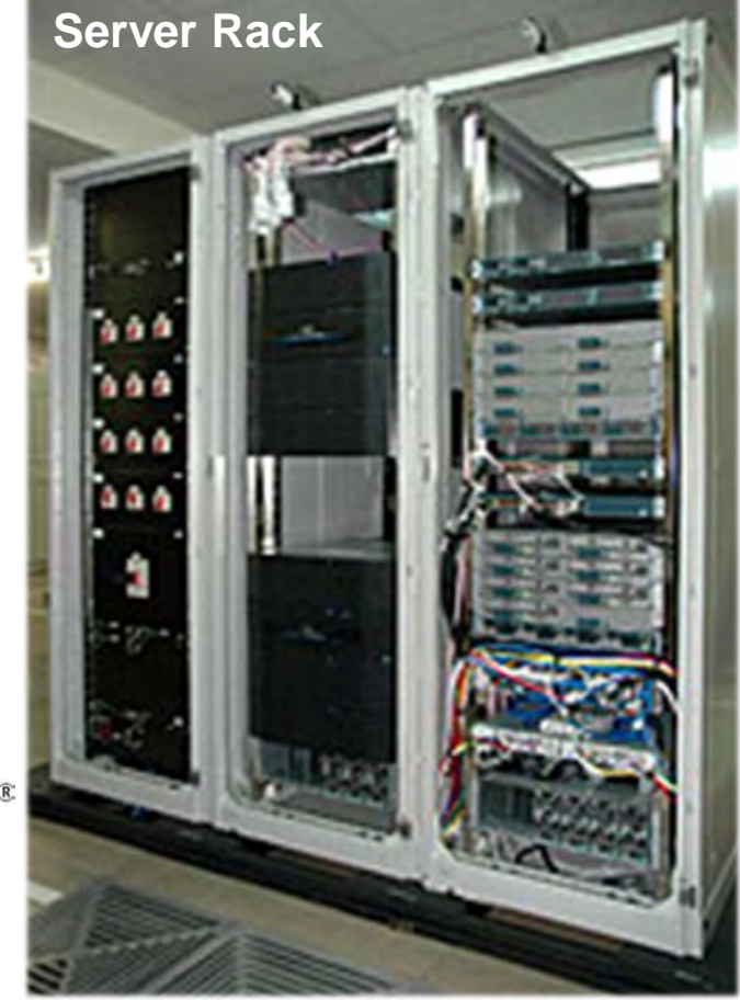
NTT Data INTELLILINK Corporation